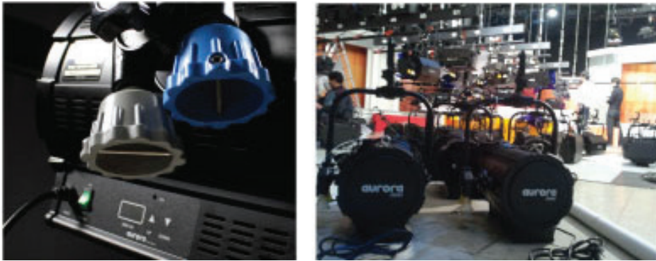
Aurora 2000S with a pole-operated yoke for hanging

Pole-operated yoke for panning and tilting is sold at option.